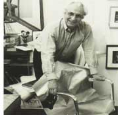
Frank O Gehry