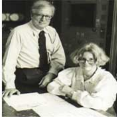
Robert Venturi & Denise Scott - Brown